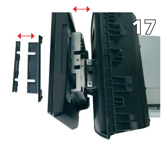
Verify the necessary lenght of the neck cover