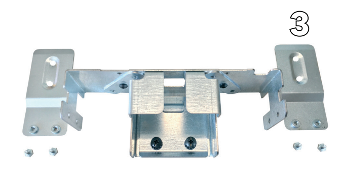
Install the side support with a wrench n°7 (not included)