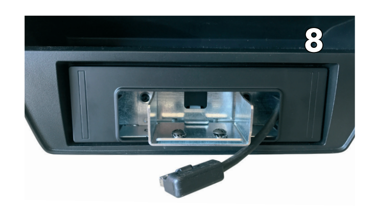
Put the DIN cover over the unit