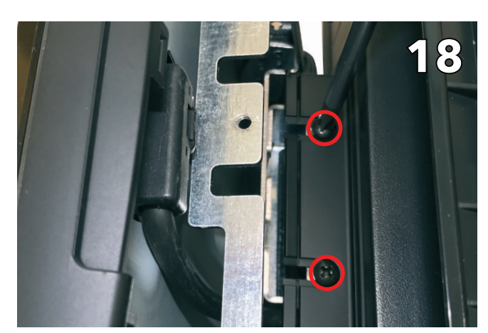
Install the neck cover onto the screen and fix the screws