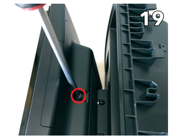
Slide the cover onto the screen and fix the screw