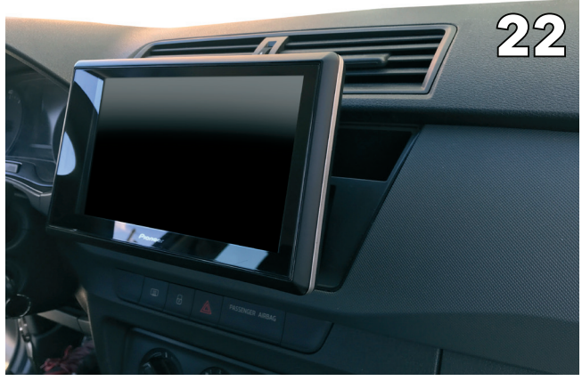
Final product image