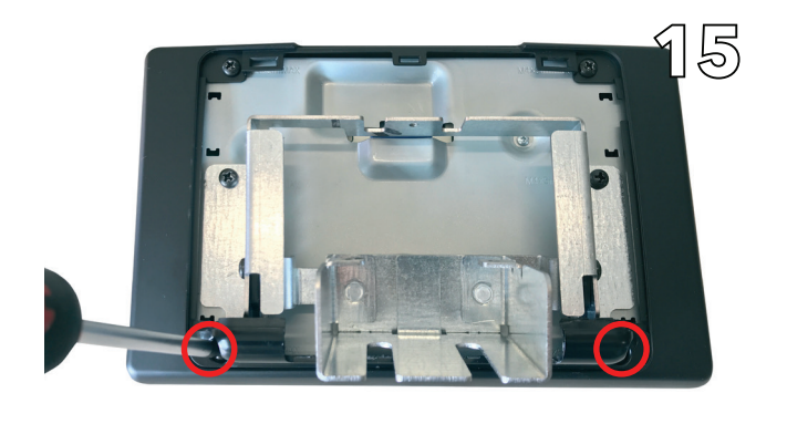
Fix the bottom cover using two screws