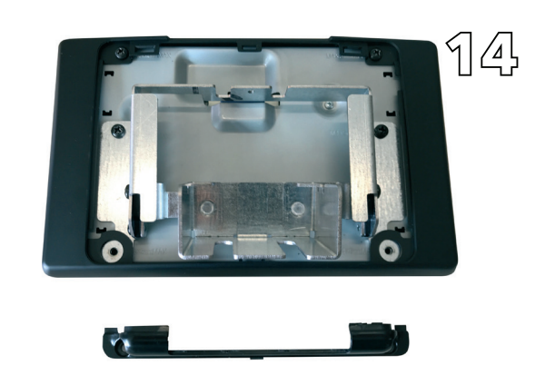
If the bottom cover collides with the metal bracket, you need to break off some strips