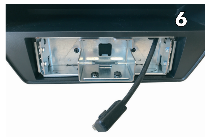
Whilst sliding the silver box in the car pull the display cable through using some tape (not included)