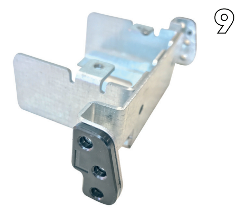
Click the plastic tabs onto the metal holder as shown