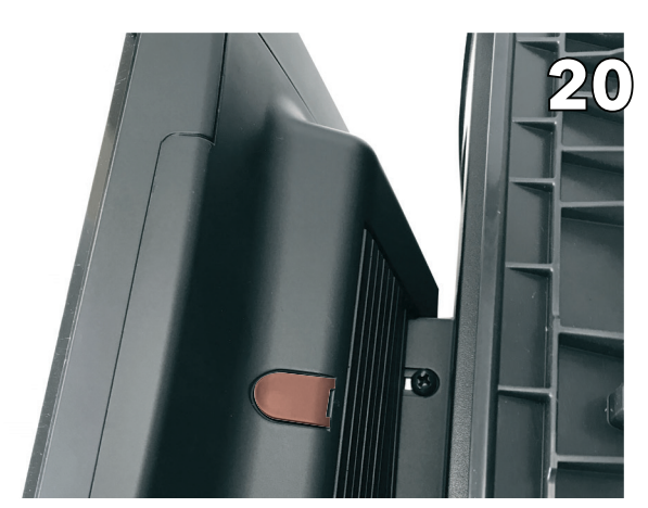
Put the screw cover over it