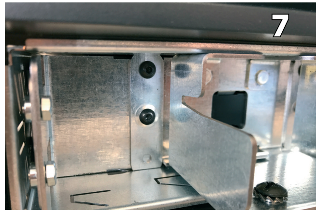
Close the locking tabs and secure with the necessary screws