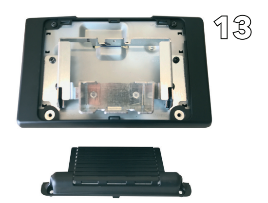
After having to determined the correct position install the bottom cover