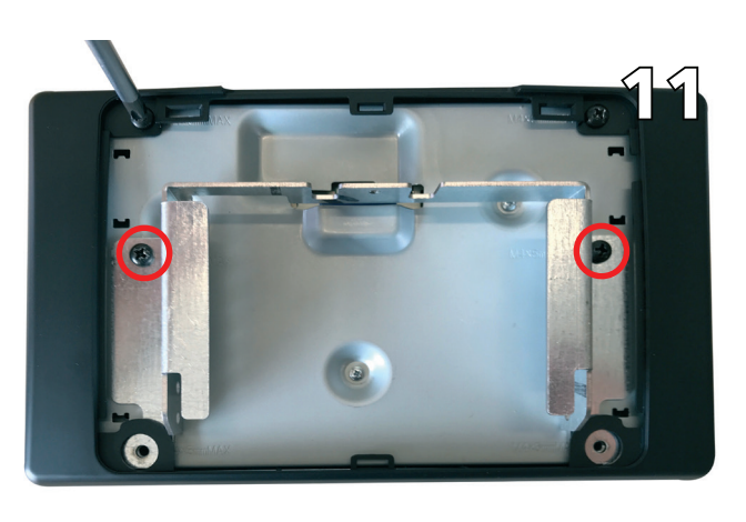
Put the screen holder on and fix only the top two screws