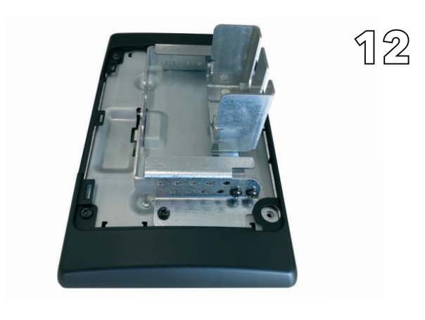
install the metal holder - you can adjust height and angle by using different positions