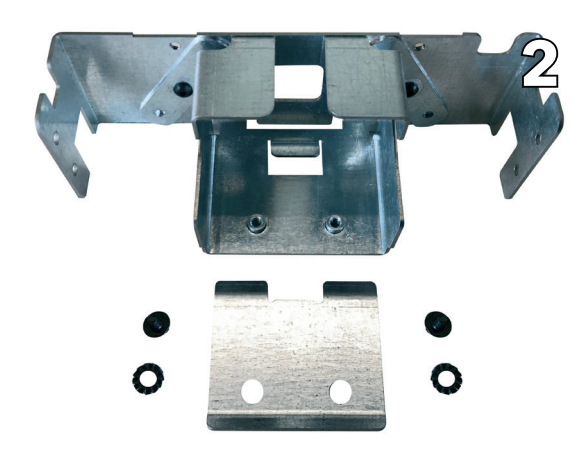
Install the sliding mecha with the supplied hardware