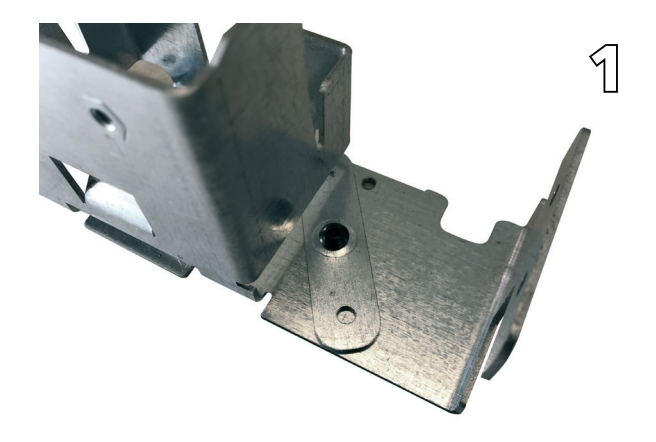
Mount the locking tabs (bulge up) onto the unit support