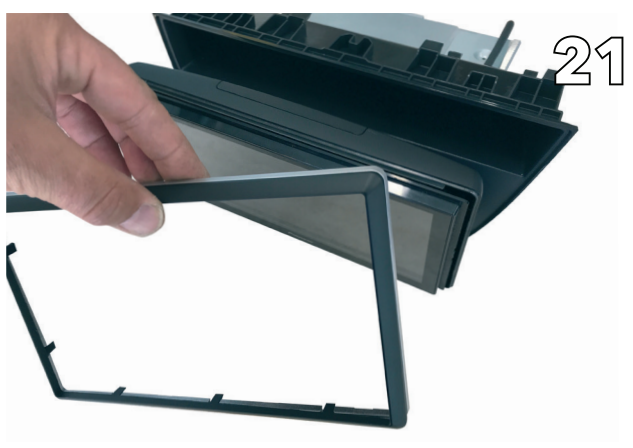
Install the front cover with the chrome bezel