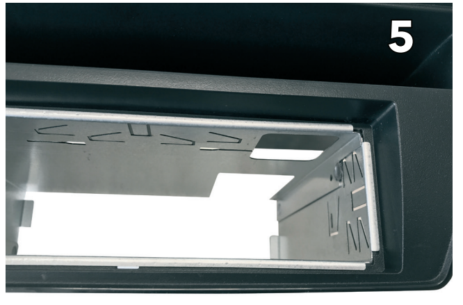
Slide the metal cage into the vehicle with the opening on top