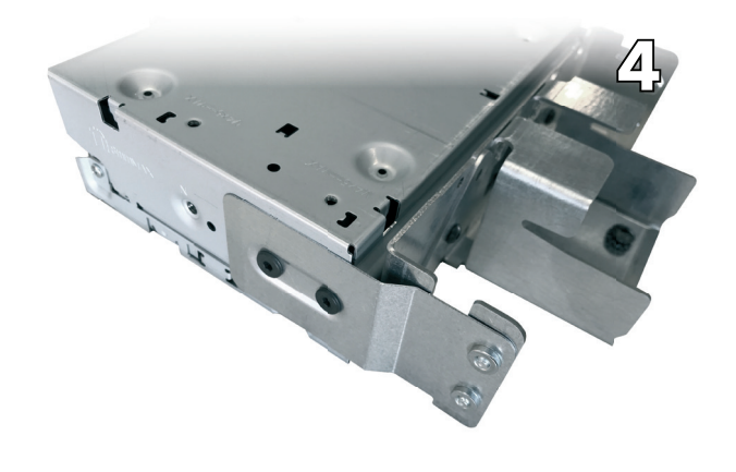
Once finalised, mount the complete bracket to the silver box using the supplied hex screws