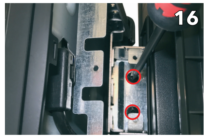
Slide the screen into the support and secure with two screws